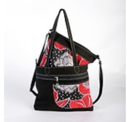
NEW! CONCUBINE FASHION AND ACCESSORIES