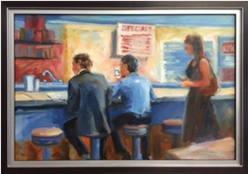
IS THIS SEAT TAKEN? OIL PAINTING BY CHERYL PEDDIE

Register by calling 403-652-2512 $95 plus GST for either workshop. Students will work in either oil or acrylic paint and must bring their own supplies.